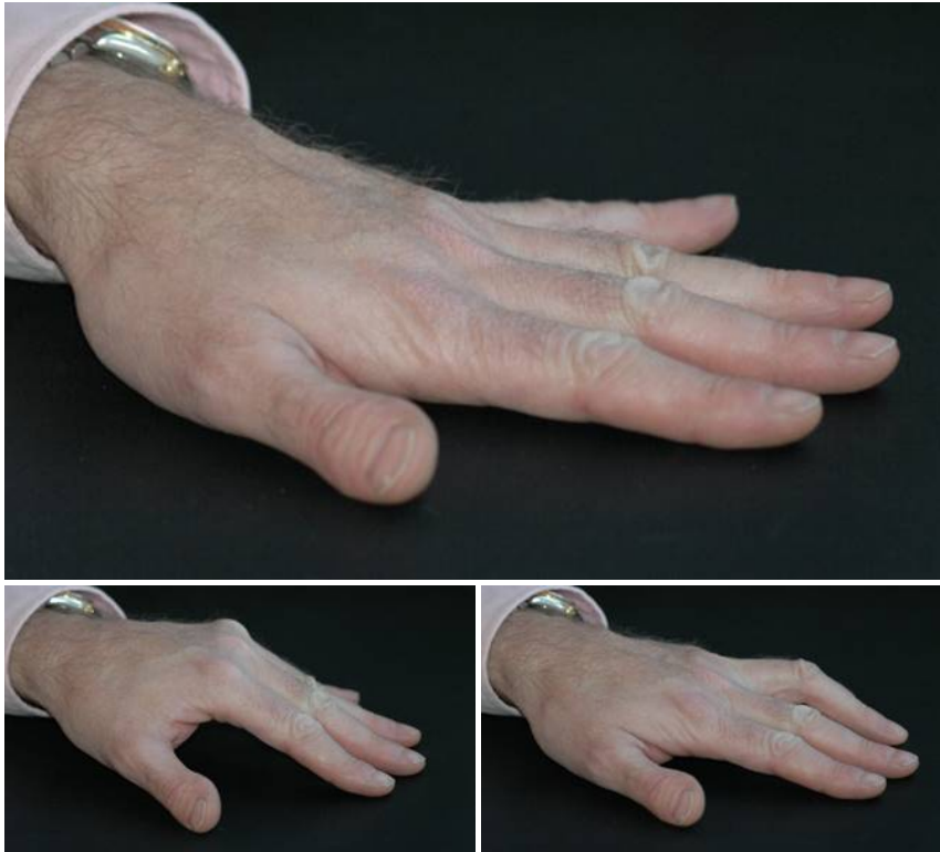
Figure 1 Unable to get your hand flat?

The signs of Dupuytren's disease include swellings in the palm, pits in the skin, and taught bands in the skin causing prevention of straightening of the fingers. Bent finger joints make it difficult to put on gloves, wash and shave. The GP will refer you when you no longer can get your hand flat on a table.